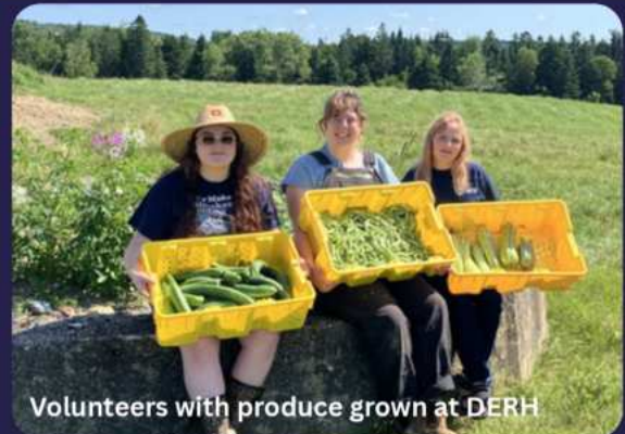
Volunteers with produce grown at DERH

“Everyone at DERH is excited to steward this land with DCC together, more intentionally. This partnership builds on a relationship that long predates this acquisition, with DCC assisting us over all of our growing seasons with mowing and helping us keep the space tidy. We know collaboration means more food coming out of the field, more nearby trails to explore, and more community engagement with our projects overall. I love how both DCC and Healthy Acadia are committed to making Machias a healthier place, and a more beautiful one, too.”