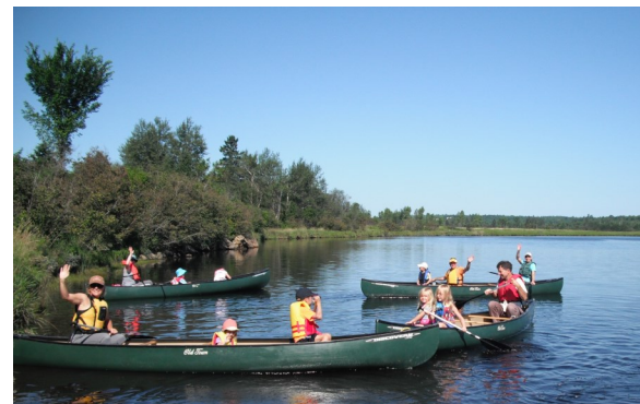
Young families on a canoe outing on the Middle River

Paddlers will find signs directing them to the hand-carry boat launch at the end of the parking area.