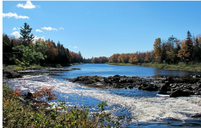
View of the Machias River from Machias River Preserve