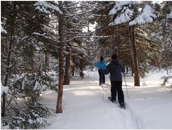
Both preserves offer four-season fun