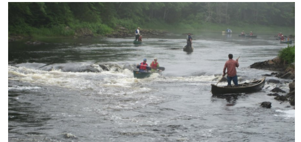
Paddlers navigate Munson Pitch on the Machias River sect with the Sunrise Trail.

Vehicle parking is available at 2 locations. The first is on Route 1A in Machias, about 0.5 mile south of the Down East Community Hospital and the second is on Route 1A in Whitneyville, about 0.3 mile north of the bridge over the Machias River. From the Sunrise Trail, ATVs and snowmobiles will find small parking areas where the Homestead Trail and Hemlock Trail inter-