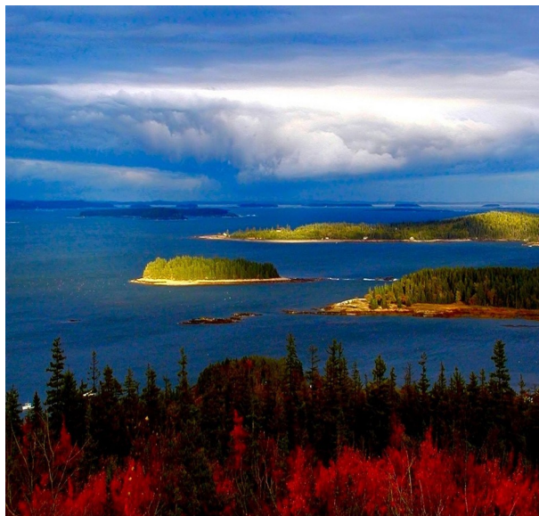
Storm over the Greater Pleasant Bay from the Pigeon Hill Summit.