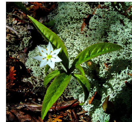
Star Flower ( Trientalis borealis ) and Reindeer Moss ( Cladonia portentosa )

Pigeon Hill is an excellent location to sight hawks during migration and common migratory birds throughout the summer. Pileated woodpeckers, spruce grouse, ruffed grouse, black-capped chickadees, red breasted nuthatches, dark-eyed juncos, American goldfinches, ravens, crows and bald eagles are year-round residents of the area.